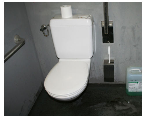
WC and WC layout plan

Validity: April 2012, errors and omissions excepted, Graz Tourism in cooperation with Hartberg Disability Support Group