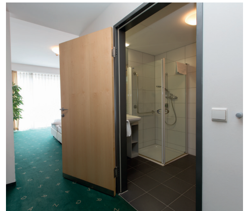
Entrance to bathroom in room