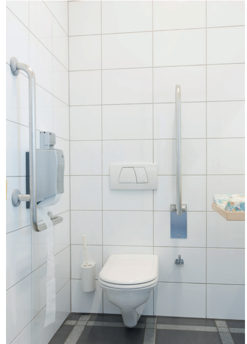
Accessible WC on ground floor