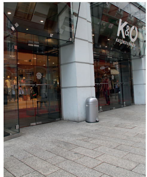
Entrance of Kastner & Öhler