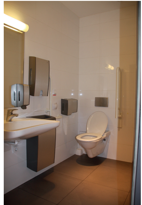
Accessible WC Kastner & Öhler